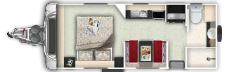
CS11 – 23' Bushranger