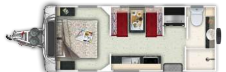
CS7 – 21' Bushranger