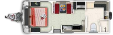
CS10 – 23'6 Bushranger