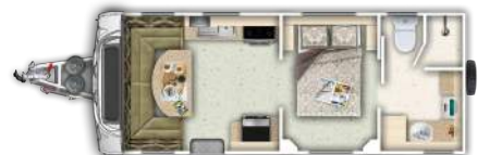
CS9 – 23' Bushranger

*Disclaimer: The information contained within this brochure is provided for information purposes and intended as a guide only. Prices, photographs, floorplans, caravan specifications and model features, warranty information and standard inclusions are subject to change at any time.