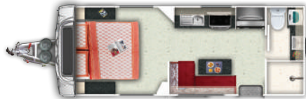
CS5 – 17' L Shape Bushranger