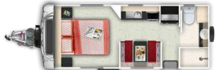
CS5 – 18' Café Dinette Bushranger