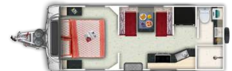
CS6 – 21'6 Bushranger