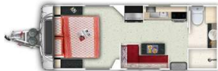
CS1 – 21' L Shape Bushranger